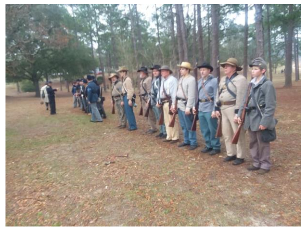
The Reenactors pose for a photo in front of the crowd at DeFuniak Springs after the Battle.