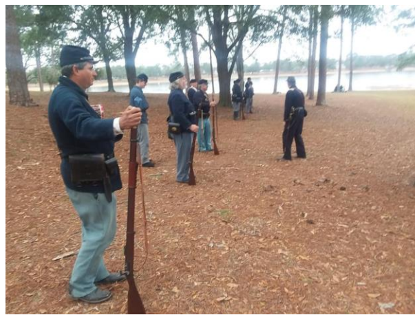
The Federals are in skirmish order in DeFuniak Springs before the battle on Sunday January 25, 2020.